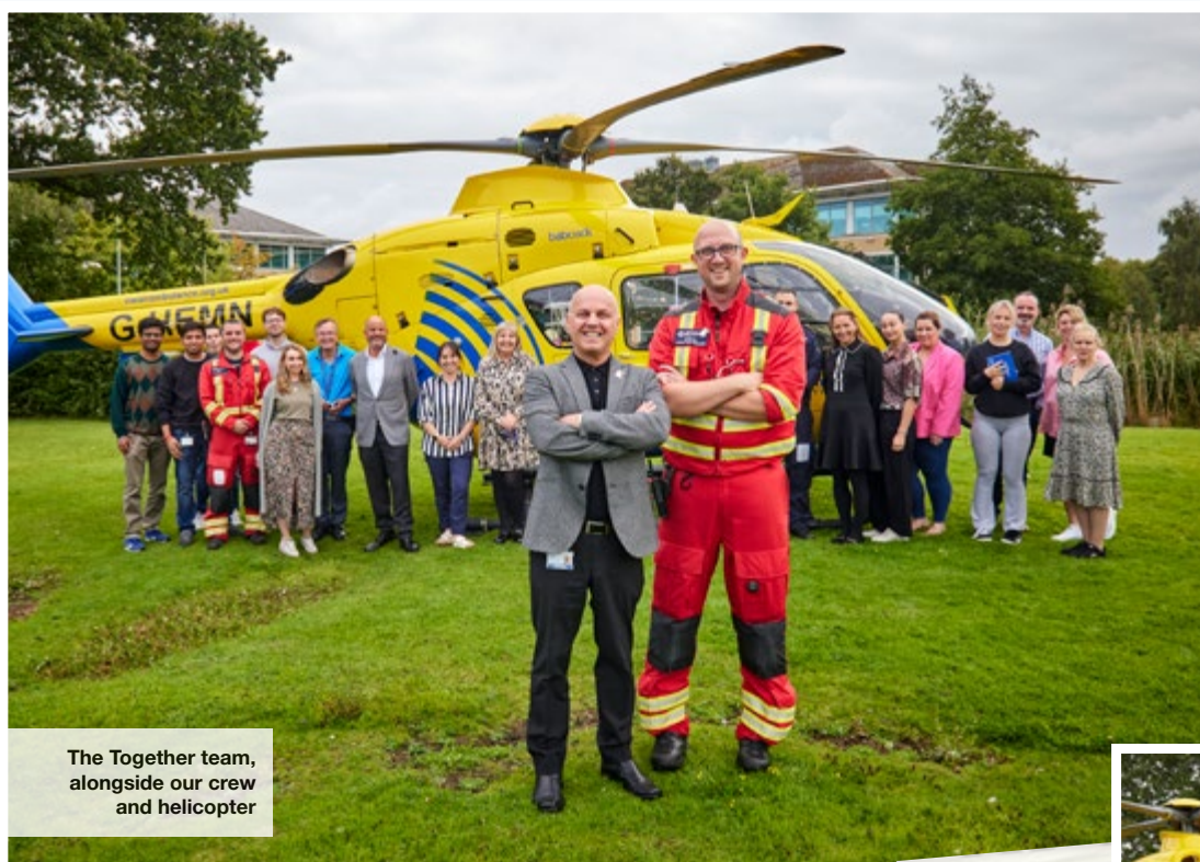
The Together team, alongside our crew and helicopter