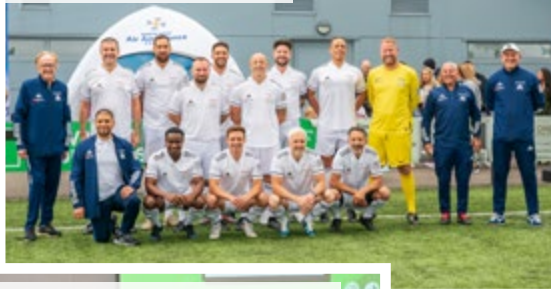
AFC Stockport vs Jet2.com and Jet2Holidays All Stars football match in June