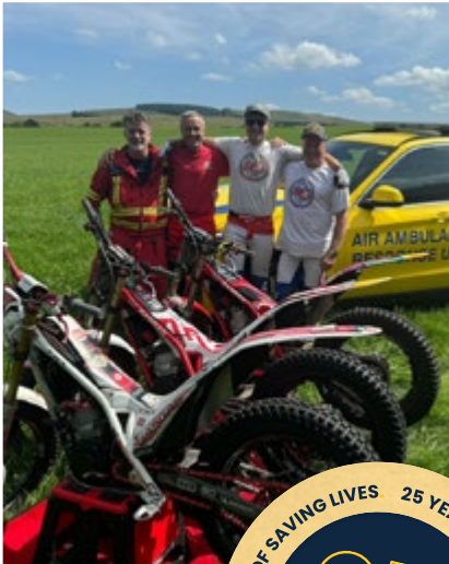
Cheshire trial bikers after taking on the gruelling 24-hour bikeathon raising over £5,000

To be there for patients, we need your support. Did you know you can turn your hobby, skill, or interest into fundraising? There are so many unique ways to get involved and create your own fundraiser.