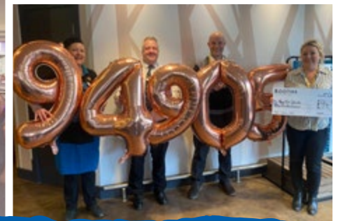
Seven Booths stores raised £94,905 in 2023/24

Thank you for being part of our journey, and for helping us save lives every day. Here's to the next 25 years!