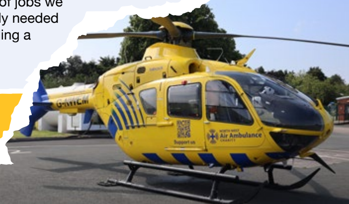
One of our upgraded helicopters at Barton air base

The night car is manned by two CCPs or a CCP and a consultant-level doctor. As with our helicopters, the cars carry vital medical kit, along with our crew, and allow us to bring the hospital to the patient.